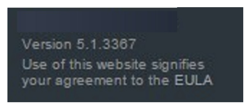
FIGURE 3 Current Cloudpath Version Lower Left

2. The Cloudpath version is displayed in the lower left corner of the Admin UI, and it is visible on all pages.