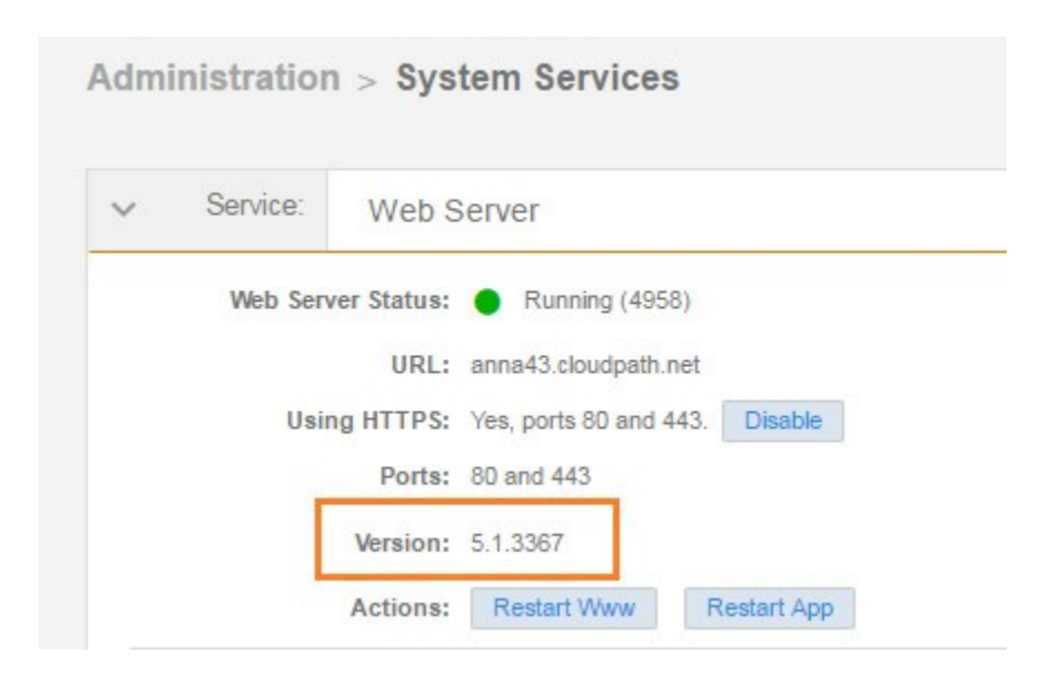
FIGURE 2 Current Cloudpath Version System Services

2. The Cloudpath version is displayed in the lower left corner of the Admin UI, and it is visible on all pages.